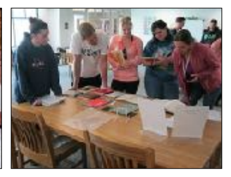
Priority 1: Collaborate with campus partners to develop innovative, highquality academic programs that support critical thinking, experiential learning, active learning, creativity, innovation, and cross-disciplinary collaboration.

Student learning is the library's highest priority. Through collaborative partnerships across campus, we contribute to the development of high-quality academic programs through information literacy instruction, collections that support the curriculum, spaces and tools that provide unique learning opportunities, and experiences that enhance the curriculum and expose students to new ideas and perspectives.