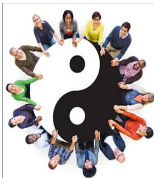
Figure 1. Team image around Yin and Yang.

Constructivism refers to a subjective collection of educational practices that are student-focused, meaning-based, process-oriented, interactive,